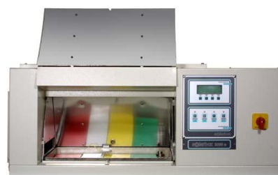
Vertical and Horizontal Salt spray chambers, 8 Models Full range of options for continuous and cycling test.