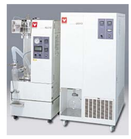
ADL311S-A + GAS410 + stand with caster wheels (optional)